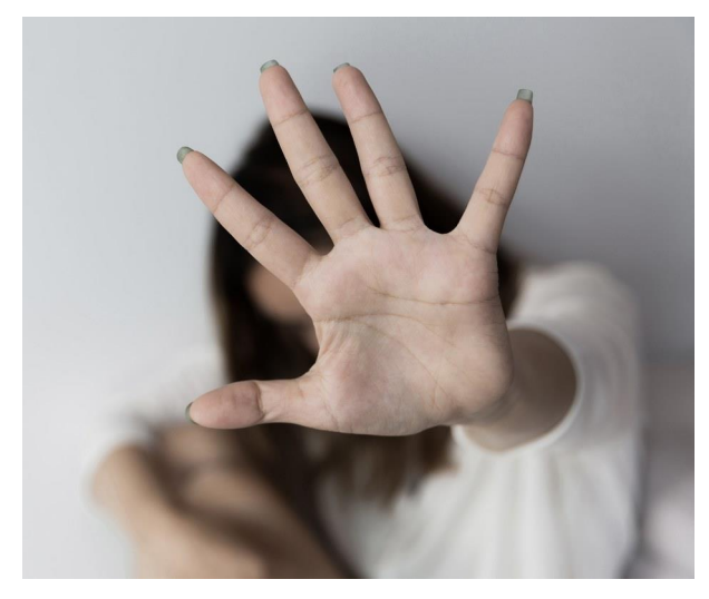
Webinar: Domestic abuse

Please use the links above to book your place. For further information, please contact Pooja Kotwal via email to <a href="mailto:pooja.kotwal@nhs.net">pooja.kotwal@nhs.net</a>.