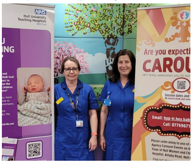
Parents-to-be invited to help their family – and generations to come

Midwives in Hull are throwing open the hospital doors in support of the city's first ever 'Baby Week'.