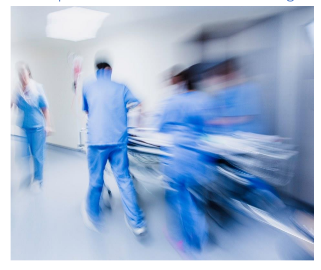
Safety in the spotlight at hospital 'Boards in Common' meeting