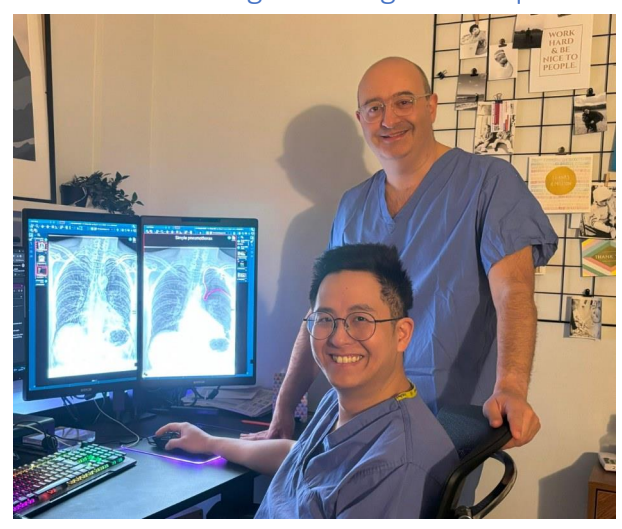
Trust introduces new AI solution to diagnose lung cancer quicker

Artificial Intelligence (AI) technology that could help diagnose patients with life-threatening diseases more quickly has been introduced at Harrogate and District NHS Foundation Trust.